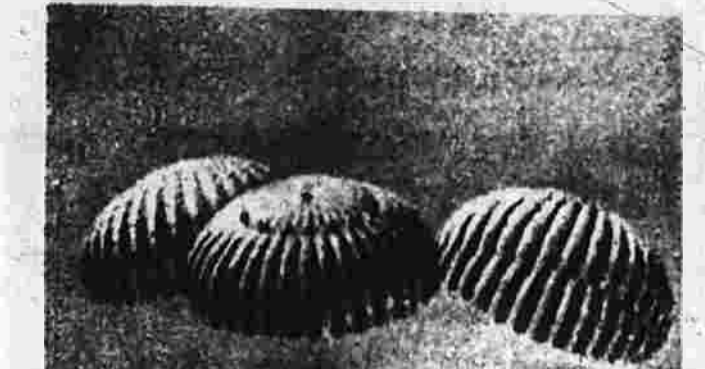
Apolo 12 spacecraft, its three parachutes billowing, plunges toward the Pacific Ocean.

U.S. Never To Resort To Germ War WASHINGTON (AP) — President Nixon renounced today any resort to chemical or germ warfare and promised to destroy existing stockpiles of bacteriological weapons.