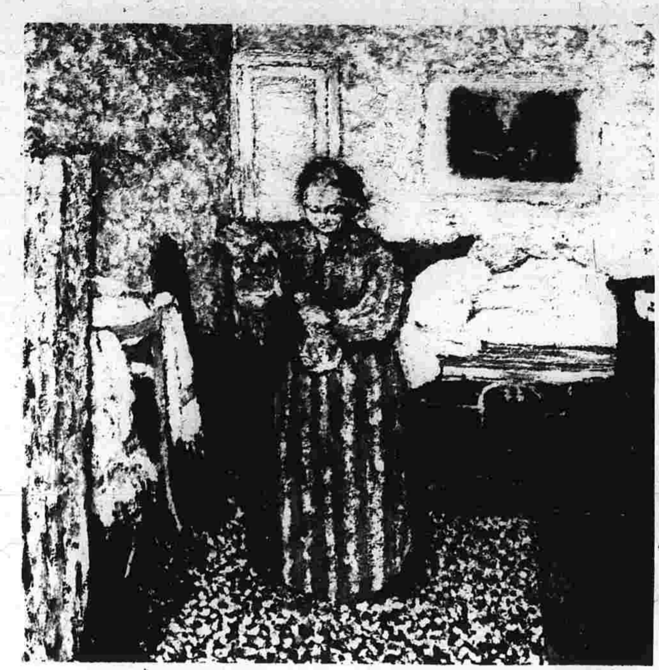
EDOUARD VUILLARD: The Artist's Mother Pouring Water Into A Carafe.

The delegates, however, carry on business as usual, drawing themselves in words and resolutions. Their New York plans have, in so far as the outside world that they are often dragged into a sense of importance, which they know, in their mind, is not theirs, simply does not exist.