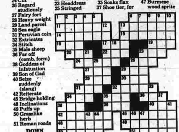
(Newspaper Enterprise Ass.)

ACROSS 1 Concrete, 2 Fall flowers, 3 Corollate, 4 Big state, 5 Furber, 6 appearance, 7 Dinner, 8 course, 9 An English, 10 rulling house, 11 Toy, 12 Tangle, 13 Numbers (ab.), 14 Twisted, 15 Pony, 16 Arrow, 17 shaver, 18 Cut, 19 regard, 20 stultionally, 21 Fairy feet, 22 Heavy weight, 23 Land parcel, 24 Eclectic, 25 Pervious coin, 26 Siphon, 27 Siphon, 28 Siphon, 29 Siphon, 30 Siphon, 31 Siphon, 32 Siphon, 33 Siphon, 34 Siphon, 35 Siphon, 36 Siphon, 37 Siphon, 38 Siphon, 39 Siphon, 40 Siphon, 41 Siphon, 42 Siphon, 43 Siphon, 44 Siphon, 45 Siphon, 46 Siphon, 47 Siphon, 48 Siphon, 49 Siphon, 50 Siphon.