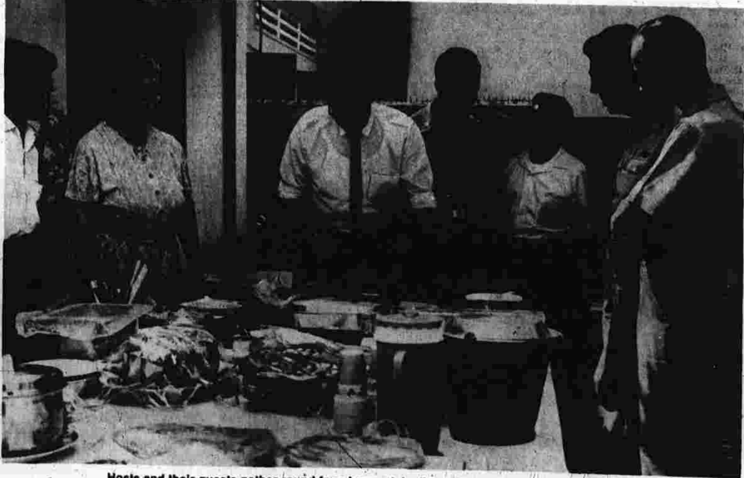
Hosts and their guests gather round for a home-style dinner in a backyard in Saigon.