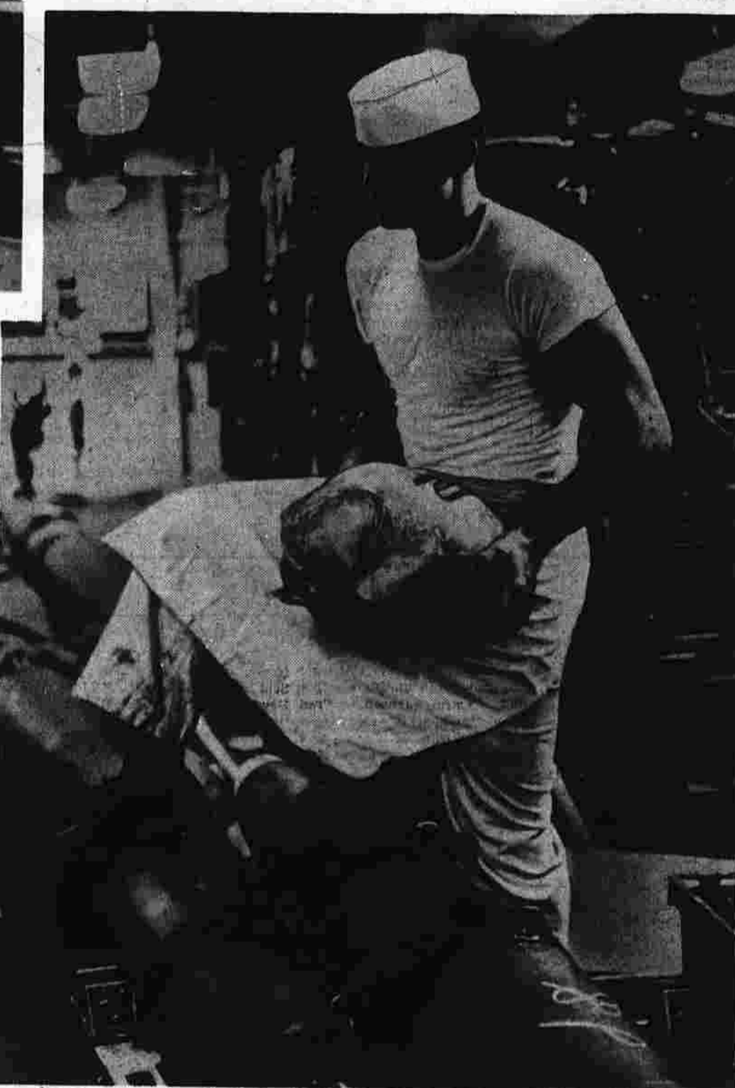
On board an aircraft carrier in the Gulf of Tonkin—a turkey on its way to the mess table.