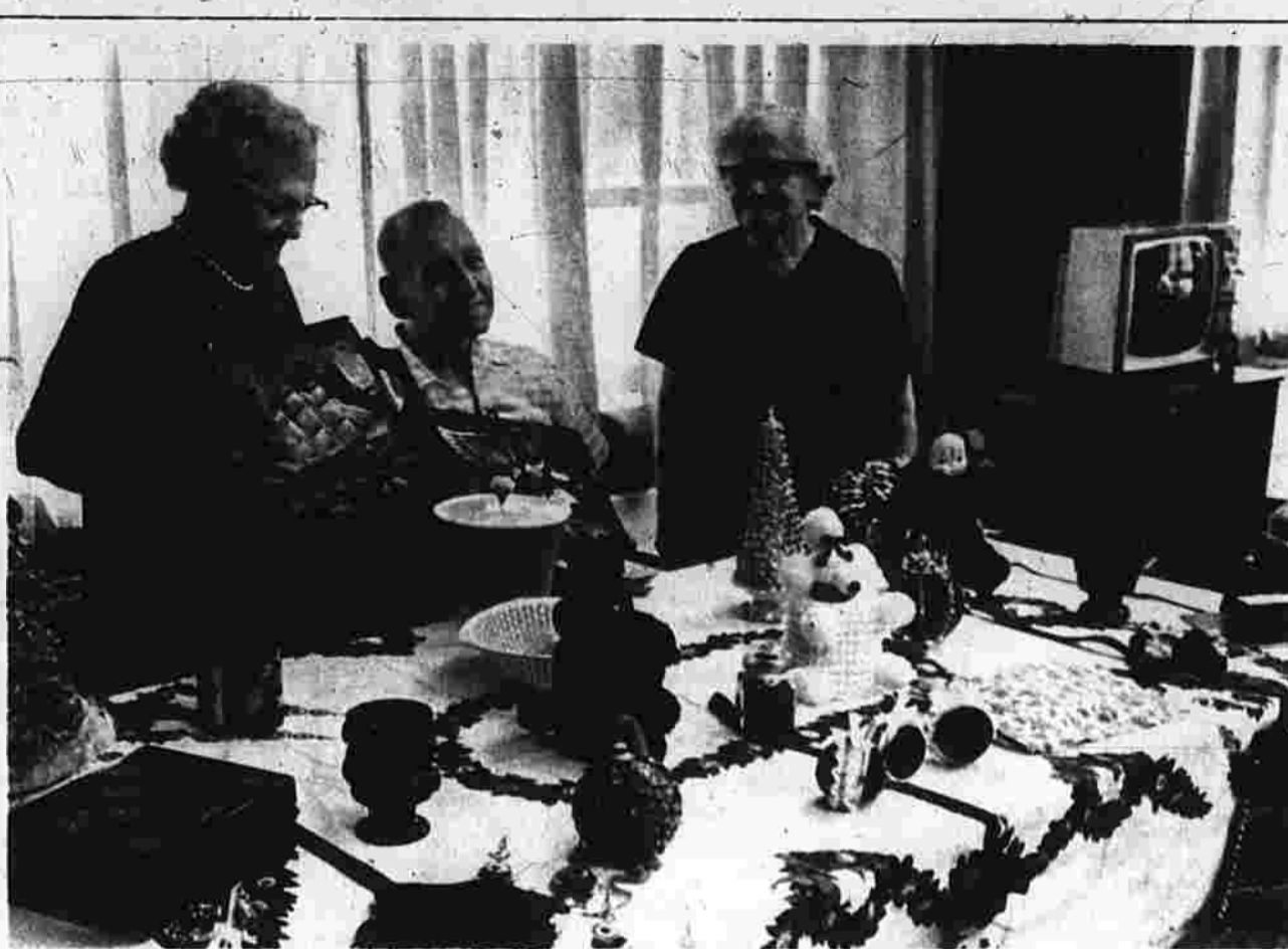
All Ready for Crestfield's Fair