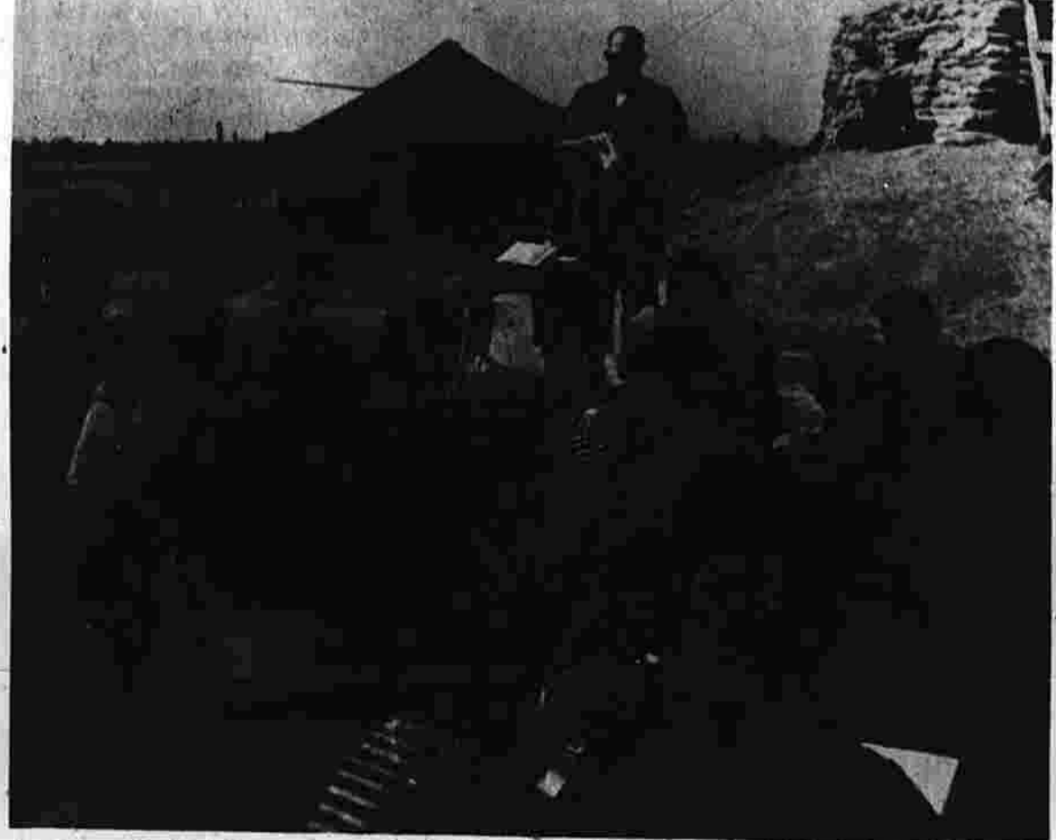
A chaplain conducts Thanksgiving services in the field at Binh Son, Vietnam.