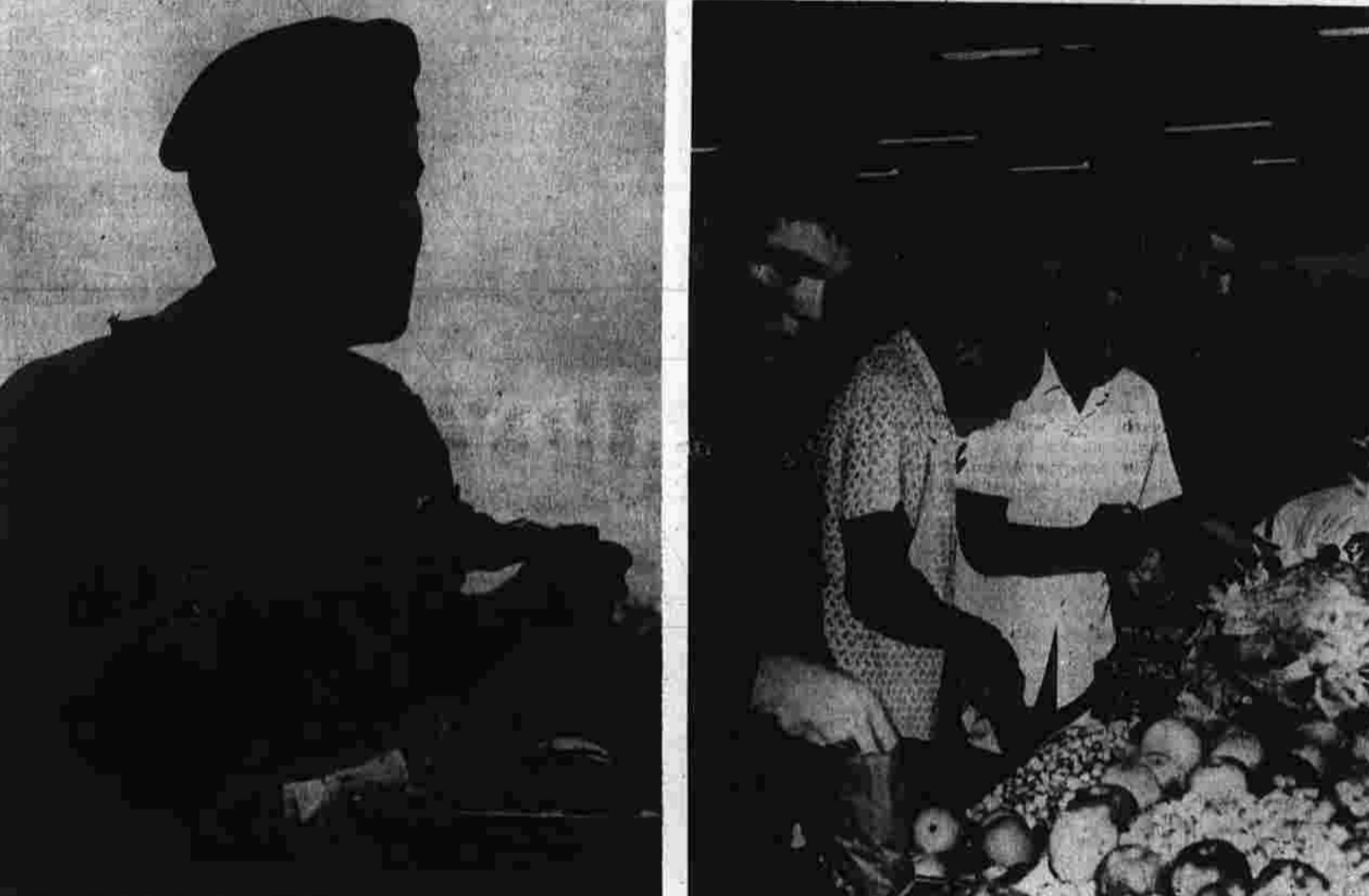
A turkey drumstick in War Zone D, north of Saigon. Hot Thanksgiving meal is flown in by helicopter.

This year U.S. servicemen in Vietnam join in unity of spirit with their fellow countrymen at home and wherever else in the world they may be, to continue a beloved tradition which goes back to the very founding of the nation. In 1621, Pilgrim families and friends gathered for thanksgiving, games and feasting at Plymouth, Massachusetts. Then, in 1863, the first national Thanksgiving was proclaimed by President Lincoln with these words: "Because of the many blessings bestowed on America, it has seemed to me fit and proper that they should be solemnly, reverently and gratefully acknowledged as with one heart and one voice by the whole American people. I do, therefore, invite my fellow citizens in every part of the United States and also those who are at sea and those who are sojourning in foreign lands to set apart and observe the last Thursday of November next as a day of Thanksgiving."